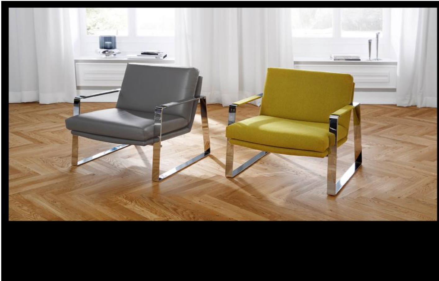
Armchair in leather Touch grey and sample fabric