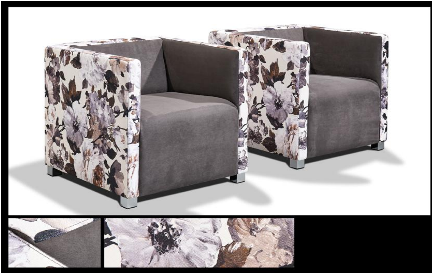
Armchair in Crown anthracite / Flower Power grey